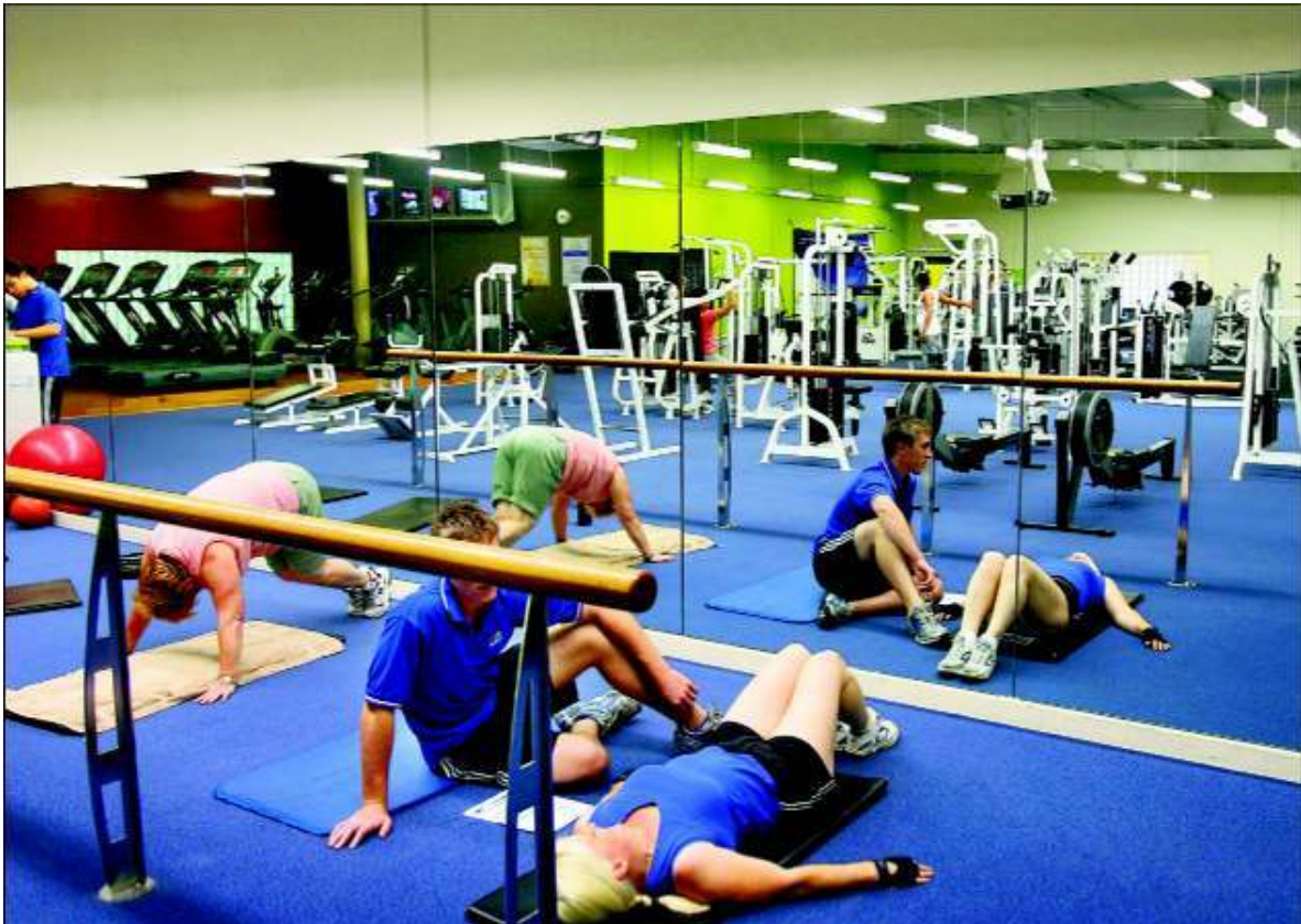
Role model: The Inspire Life centre, Bentley, on which the new centres will be based.

He said construction on the Wanneroo and Mandurah sites was expected within five months.